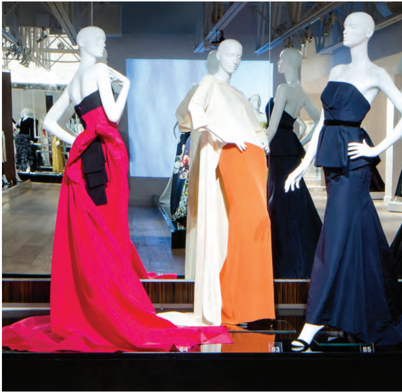
From left to right: Raspberry and black strapless faille gown with dramatic bustle detail, Pre-Fall 2014. Worn by Taylor Swift at the 2014 Golden Globe Awards, Beverly Hills. Courtesy of Carolina Herrera.