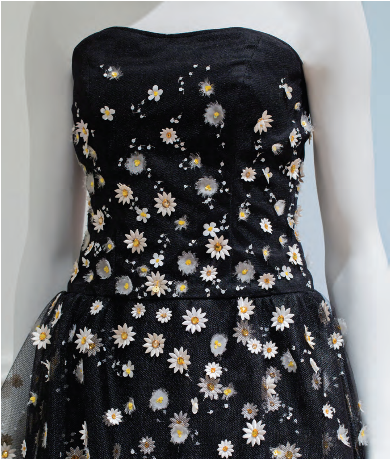
Black strapless embroidered daisy tulle gown, Resort 2015. Worn by Stana Katic at the 2015 People's Choice Awards, Los Angeles. Courtesy of Carolina Herrera. (SCAD Museum of Art)