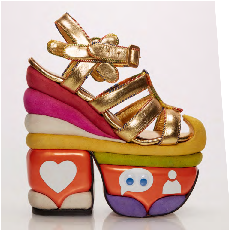
Chris Francis, Icons , synthetic suede, metallic leather, EVA rubber, PVC, patent leather, vintage thread, 2019.