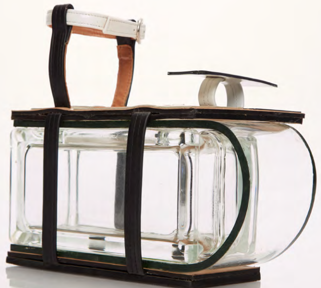
Above, from top to bottom: Chris Francis , Red Wedge , painted leather, wood, rubber, metal, 2016; Bauhaus Staircase , wood, painted leather, rubber, 2017; Wagenfeld Concept (Glass Block Shoes) , glass, acrylic, painted leather, rubber, 2016.

“ I exist happily in an experimental realm where I question design and function in the hopes of finding answers that come in the shape of shoes. ”